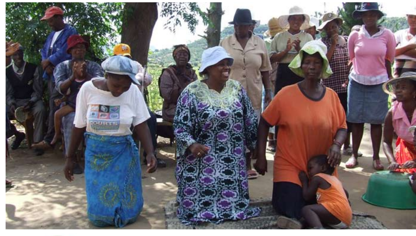
Women of Lesotho in a rural setting. The fact that majority of the men leave to work in the mines, many women have ended up taking positions of leadership.

Fifty per cent of Lesotho's population live in the rural areas. Until recently, customary laws applied in the countryside dictated that women