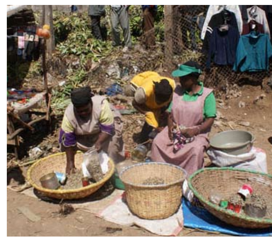
Women traders selling sardines. More women in business will lead to improved economies worldwide.