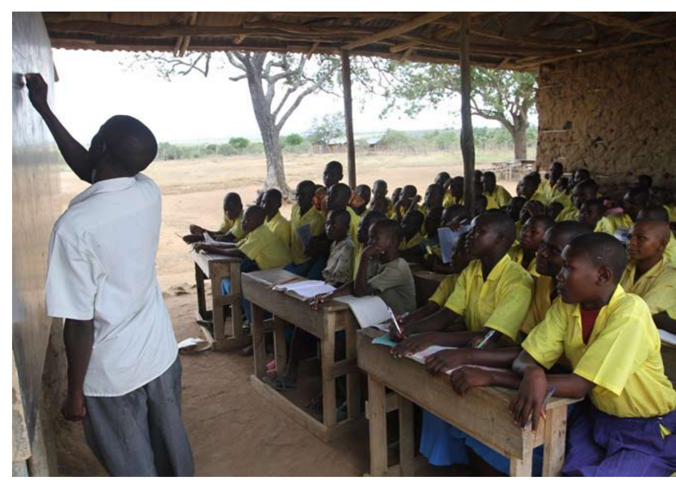
A teacher with students in class. Teachers need to encourage students, and girls in particular instead of discouraging them when they perform poorly.

It is mind-boggling to imagine the number of would-have been movers and shakers of history who are now languishing in poverty and mediocrity because they were not given an opportunity to learn or were out rightly discouraged by their teachers and parents as non-starters