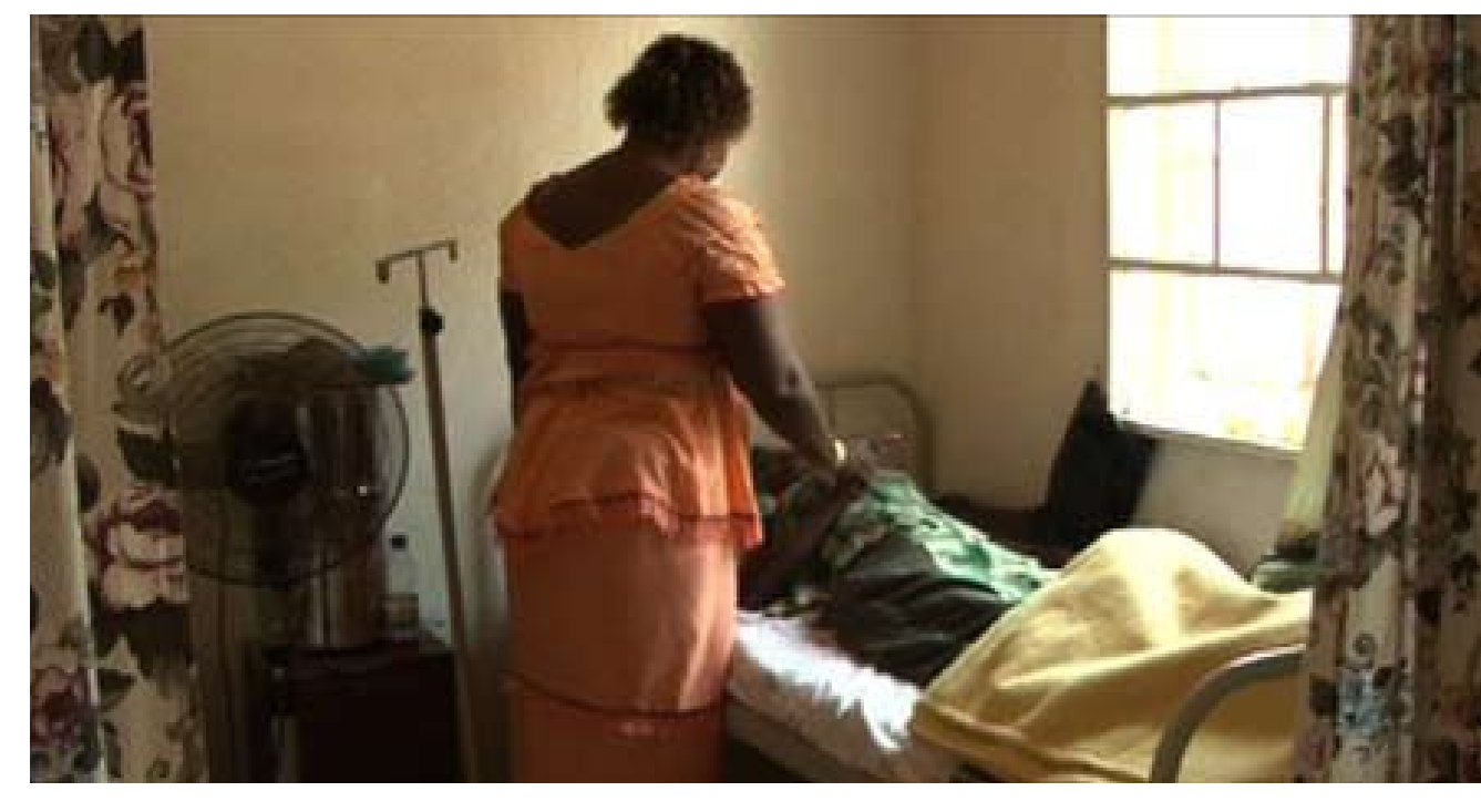
A caregiver attending to a patient at Sierra Leone's only hospice.

'She would have died. In many cases in this country, women deliver their babies but then develop