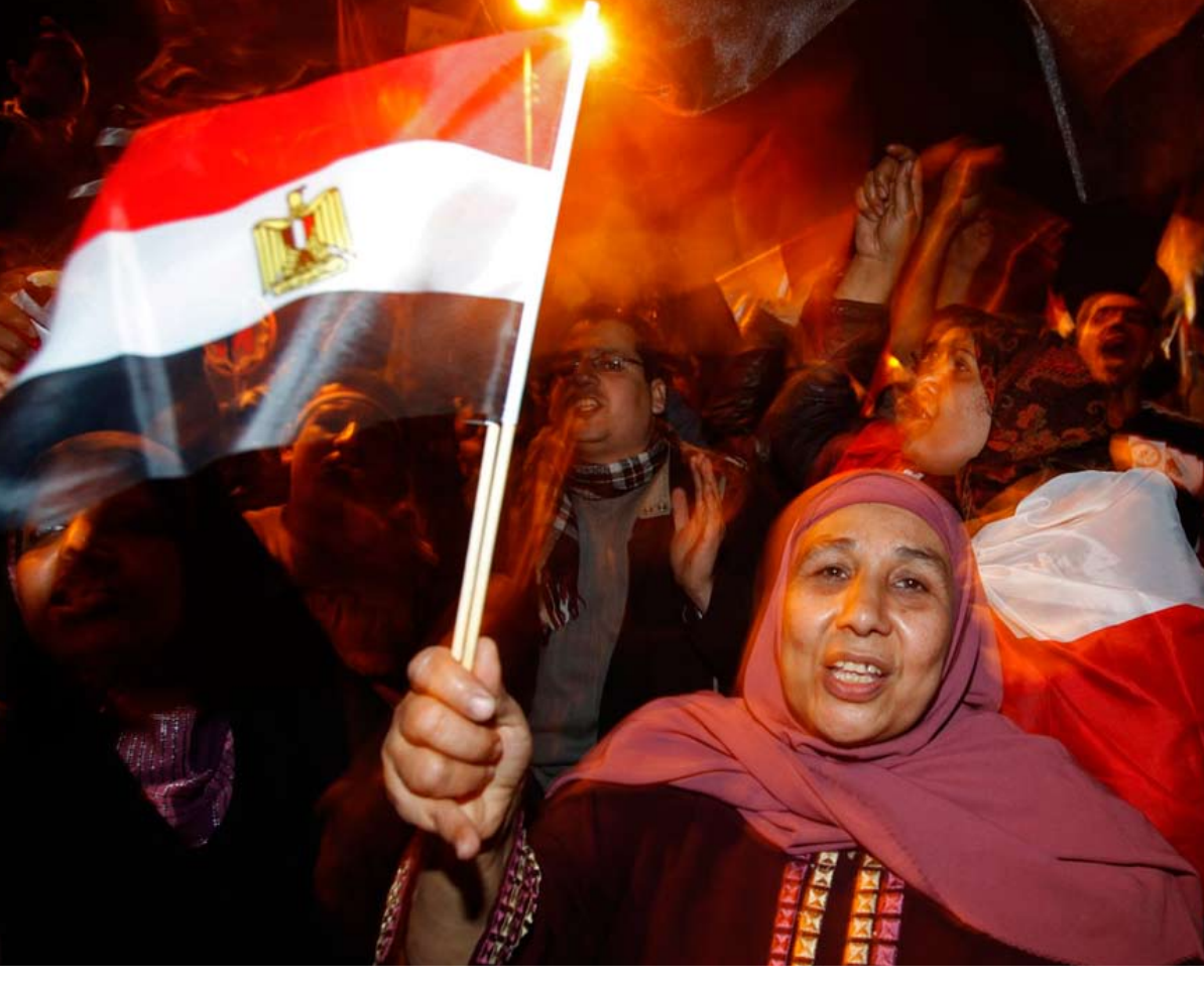
In a move not seen before, Egyptian women came out in large numbers to be part of a revolution in Tahrir Square that saw the President Hosni Mubarak leave the seat of power.

In such contexts — with a stage, a spotlight, and a spokesperson —women often shy away