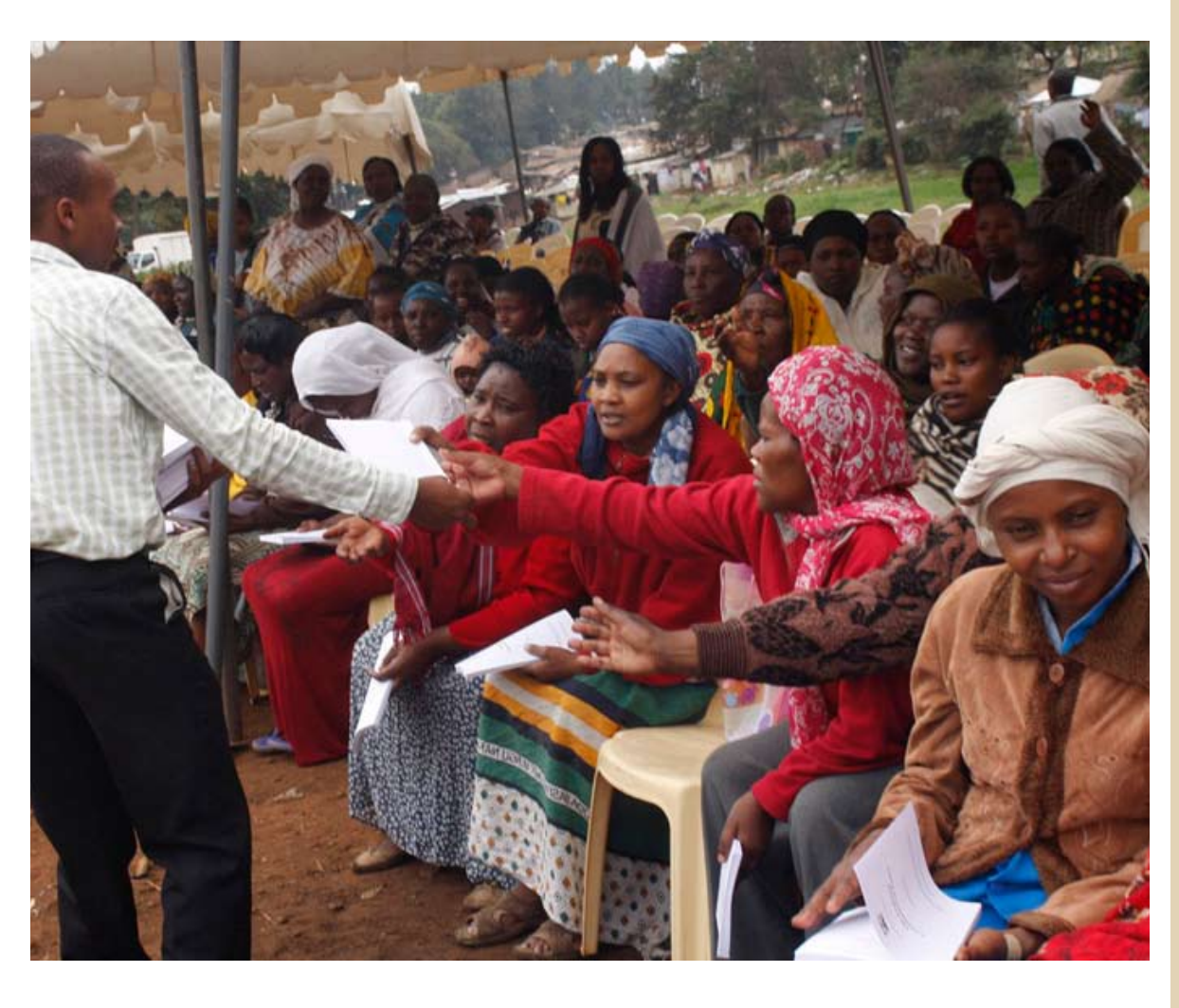
Women receive copies of the new constitution at a public rally. Women are being encouraged to ensure that they are part of the process in ascertaining the implementation of the constitution.

It was held to reflect on six months progress on the implementation process and discuss the journey