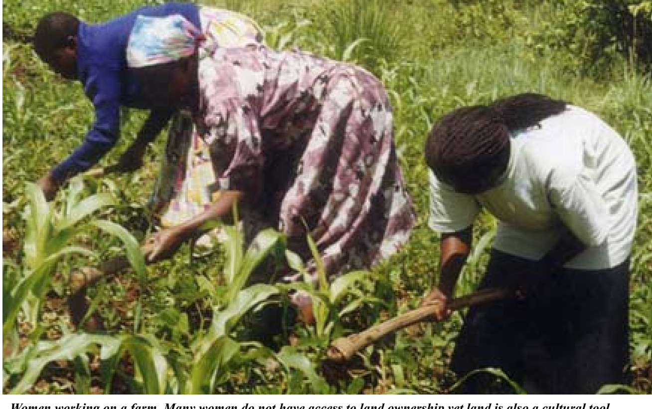
Women working on a farm. Many women do not have access to land ownership yet land is also a cultural tool which defines a people and identifies them in the context of things.

'Statements coming from politicians are still causing fear as most of the political class continue to inform their tribesmen that their land is com-