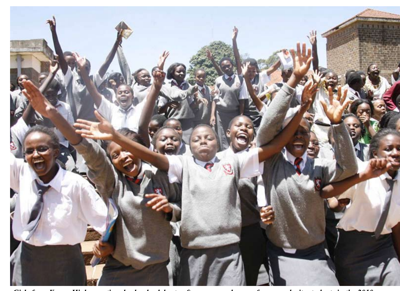
Girls from Kenya High, a national school celebrate after an exemplary performance by its students in the 2010 Kenya Certificate of Secondary Examinations. Statistics show that although the number of girls enrolling in primary school is on the increase, fewer girls enrol in secondary schools.

As entrepreneurs, women in Kenya like men can take up advantages of opportunities created in special